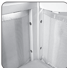
Figure 2 - Inside view